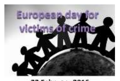
22 February 2016

Please find here victim support organisations near you: <a href="http://victimsupporteurope.eu/members/">http://victimsupporteurope.eu/members/</a>